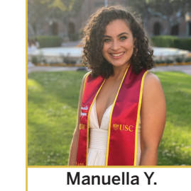
USC Masters of Social Work