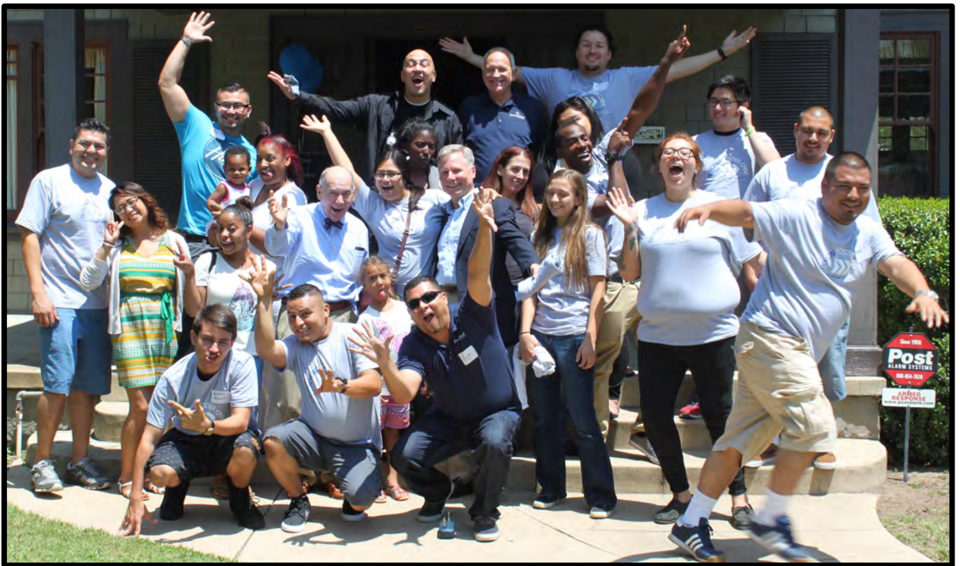
A fun and goofy picture at our “meet and greet” social