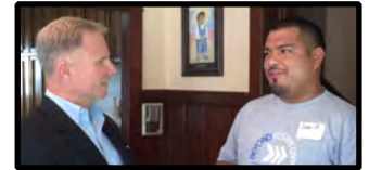
Summer 2015 Meet and Greet